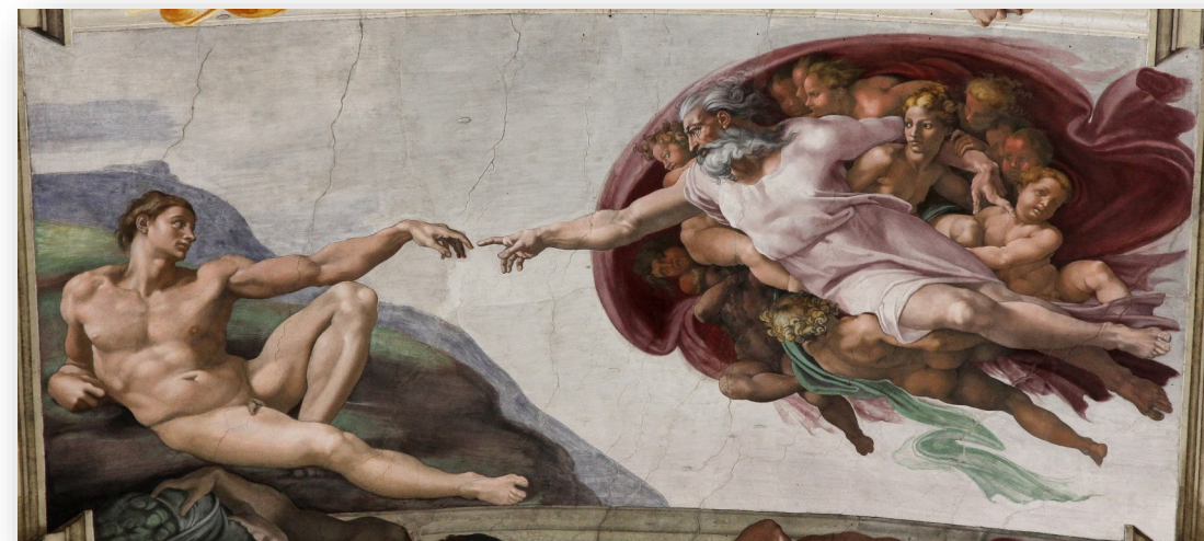
The Creation of Adam by Michelangelo in the Sistine Chapel, Vatican City

St. John's Episcopal Church 100 South Main Street | P. O. Box 5068 Southampton, New York 11969-5068 (631) 283-0549