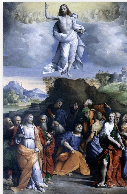
Ascension by John Singleton Copley in the Museum of Fine Arts, Boston

St. John's Episcopal Church 100 South Main Street | P. O. Box 5068 Southampton, New York 11969-5068 (631) 283-0549