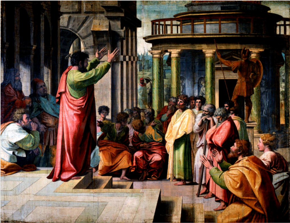
Saint Paul delivering the Areopagus Sermon in Athens by Raphael

100 South Main Street | P. O. Box 5068 Southampton, New York 11969-5068 (631) 283-0549