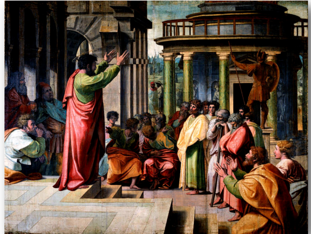
Saint Paul delivering the Areopagus Sermon in Athens by Raphael

100 South Main Street | P. O. Box 5068 Southampton, New York 11969-5068 (631) 283-0549