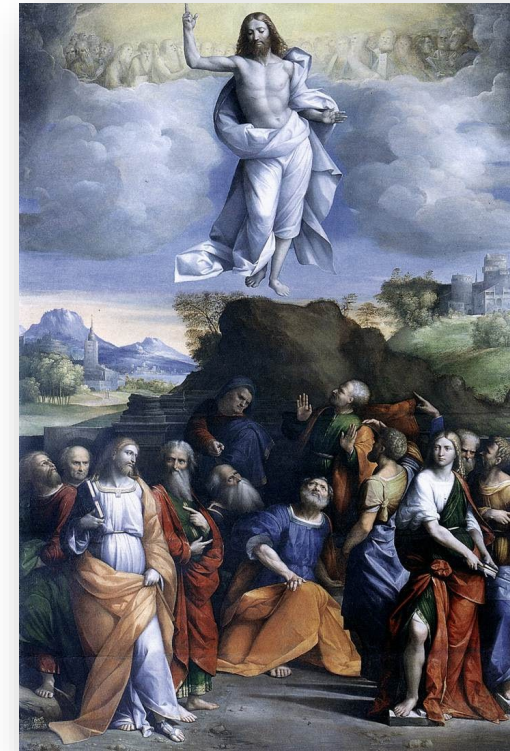
Ascension by John Singleton Copley in the Museum of Fine Arts, Boston

Services are available online through Facebook Live: Facebook.com/StJohnSouthampton