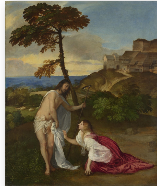
Christ and Mary Magdalene (Noli me tangere) by Titian

100 South Main Street P. O. Box 5068 Southampton, New York 11969-5068 (631) 283-0549