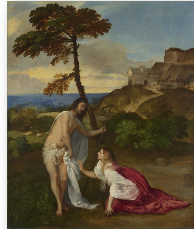
Christ and Mary Magdalene (Noli me tangere) by Titian

Services are available online through Facebook Live: Facebook.com/StJohnSouthampton