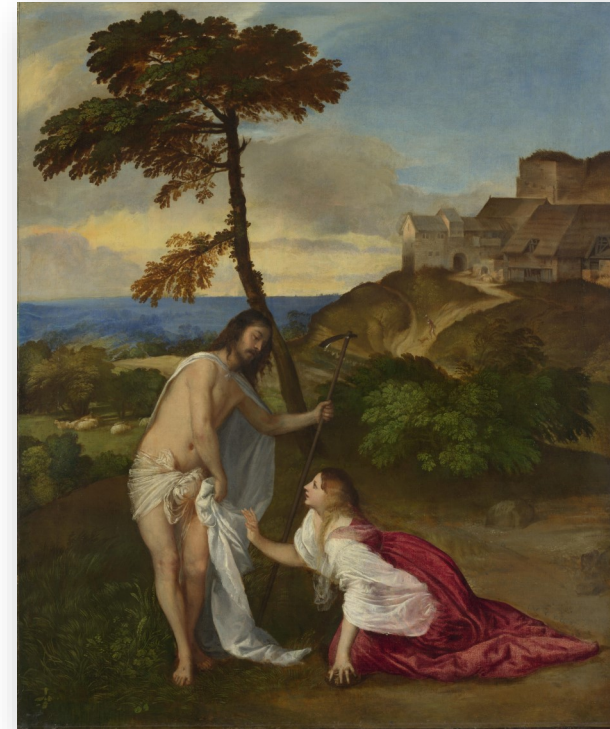
Christ and Mary Magdalene (Noli me tangere) by Titian

100 South Main Street P. O. Box 5068 Southampton, New York 11969-5068 (631) 283-0549