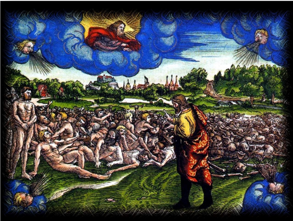
Illustration of Ezekiel 37: The resurrection of the dead bones of Israel by workshop of Lucas Cranach in the Lutheran Bible 1534

St. John’s Episcopal Church 100 South Main Street | P. O. Box 5068 Southampton, New York 11969-5068 (631) 283-0549