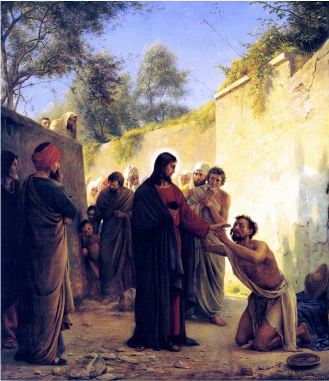
Healing of the Blind Man by Jesus Christ by Carl Bloch

St. John’s Episcopal Church 100 South Main Street | P. O. Box 5068 Southampton, New York 11969-5068 (631) 283-0549