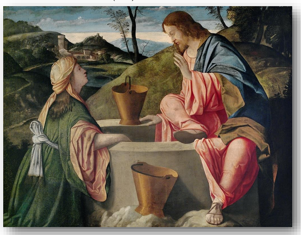
Jesus and the Samaritan Woman by Vincenzo Catena in the Columbia Museum of Art

100 South Main Street | P. O. Box 5068 Southampton, New York 11969-5068 (631) 283-0549