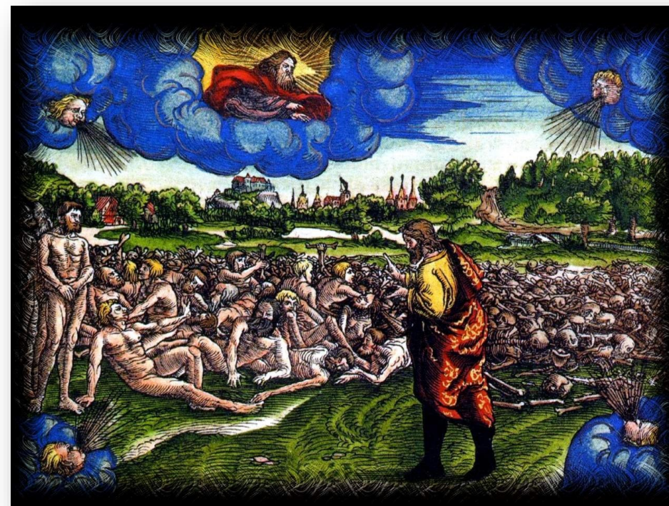
Illustration of Ezekiel 37: The resurrection of the dead bones of Israel by workshop of Lucas Cranach in the Lutheran Bible 1534

St. John's Episcopal Church 100 South Main Street | P. O. Box 5068 Southampton, New York 11969-5068 (631) 283-0549