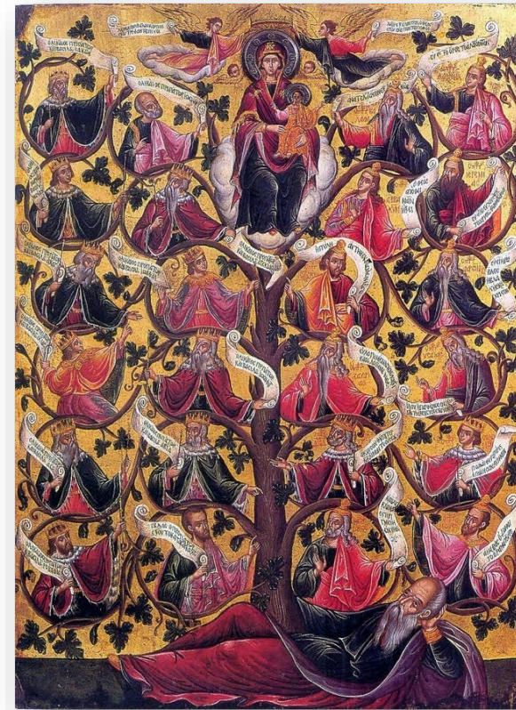
Icon of the Root of Jesse

Services are available online through Facebook Live: Facebook.com/StJohnSouthampton