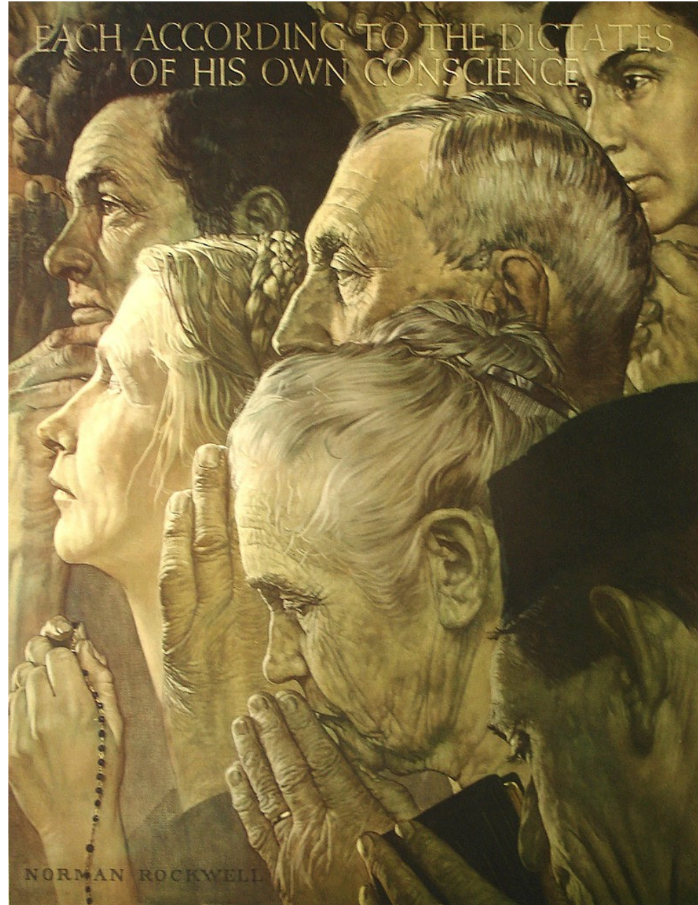
Freedom of Religion by Norman Rockwell