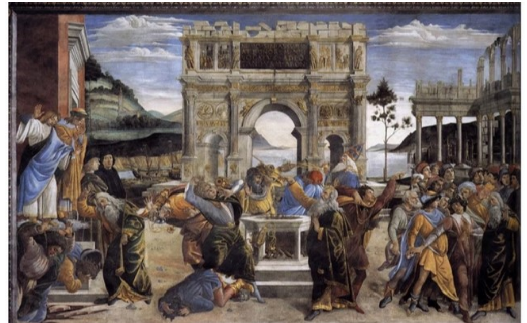
The Life of Moses