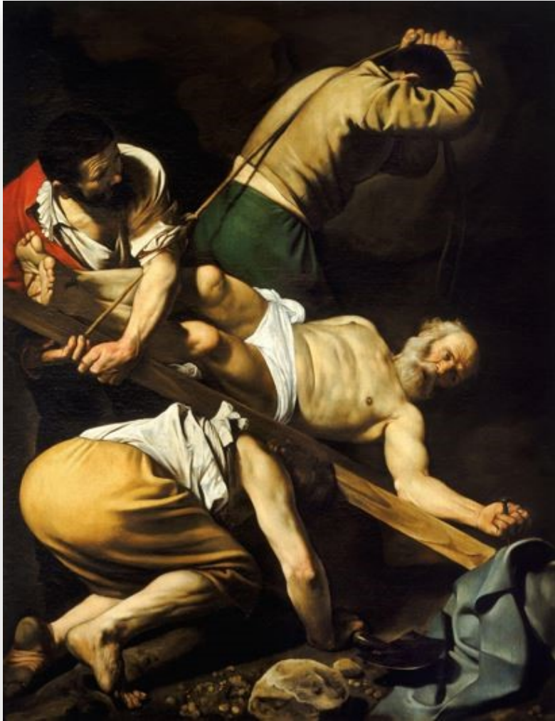
The Crucifixion of Saint Peter by Caravaggio

11 Hear, O Lord, and have mercy upon me; * O Lord, be my helper.”