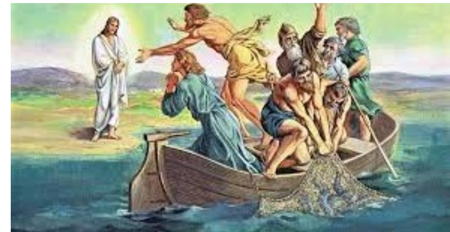
Miracle of the Draught of Fish