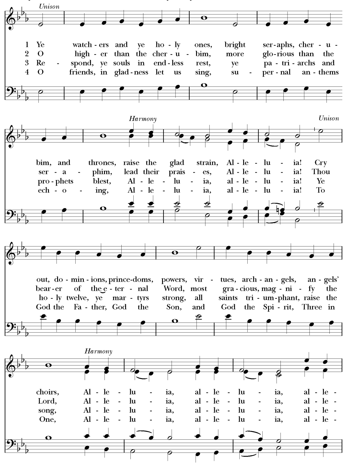
The Hymnal 1982 - #618 Ye watchers and ye holy ones